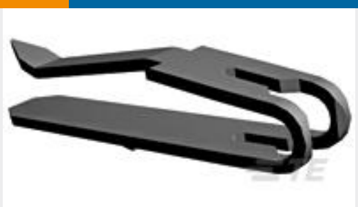
TE Part #640636-3 MTA100 V-SLOT TERM LP #22