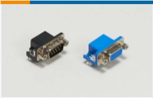
PCB D-Sub Connectors(83)