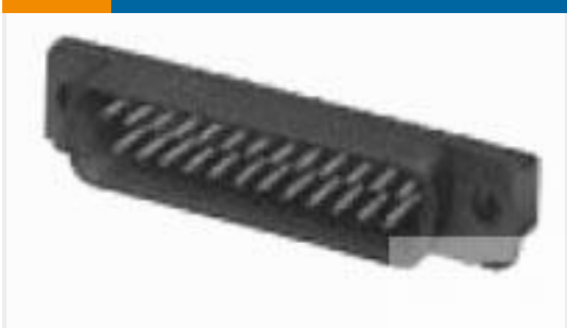
TE Part #5208010-2 HD-20 PLUG 50P VERT