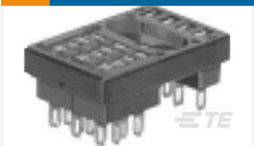
TE Part #2-1393143-5 27E213=SOCKET,R10,16,PC,PHEN