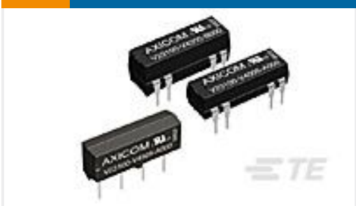
TE Part #4-1393763-4 V23100V4505A000