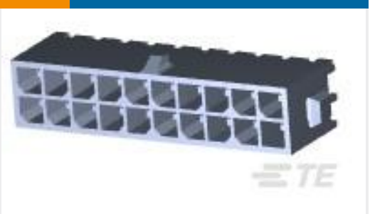
TE Part #5-794632-0 20P MICRO MNL ASSY,VRT,HDR,LF