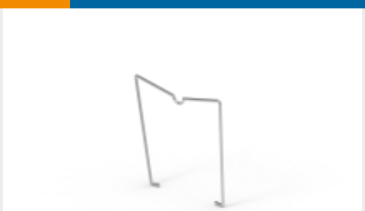
TE Part #1-1393161-9 RP28500-RETAINING CLIP