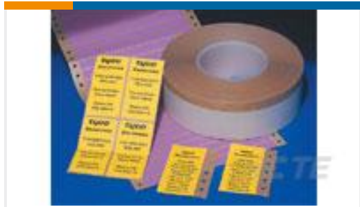
TE Part #A36576-000 TTVF3015WE1