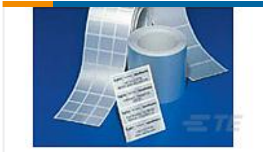
TE Part #E44791-000 MP-762508-2.5-8A