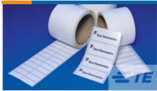
TE Part #9-1768017-0 EET-0818V-9