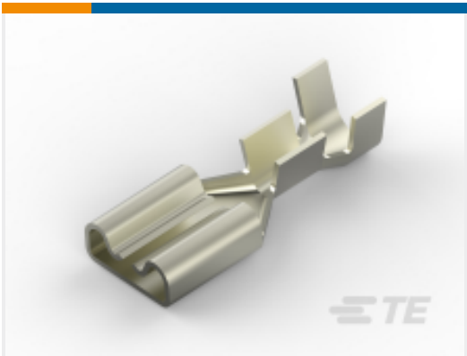
TE Part #2238143-1 250 FASTON,REC.,22-18 AWG,NPST