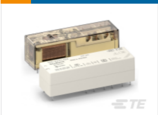
TE Part #1393260-4 Force Guided Relay with 6 contacts