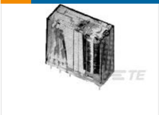
TE Part #1-1393258-5 V23047-A1024-A501