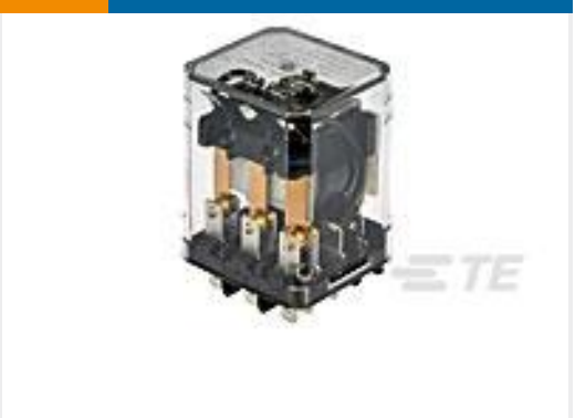
TE Part #1-1393118-2 KUP-14D15-110=KU