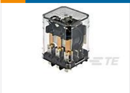
TE Part #8-1393117-7 KUP-14A35-120=KU