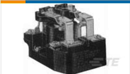
TE Part #1-1393127-6 PRD-11AH0-120=PRD