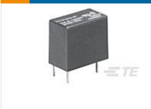
TE Part #2-1393194-1 T77V1D10-24