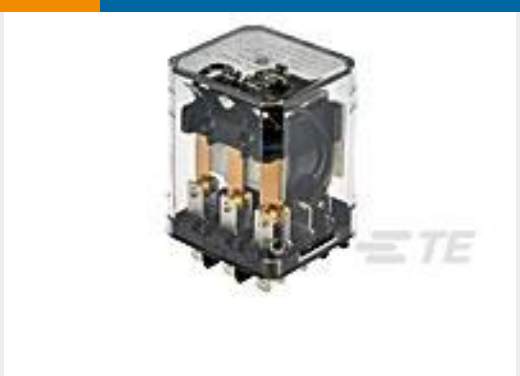
TE Part #1-1393118-4 KUP-14D15-24=KU-