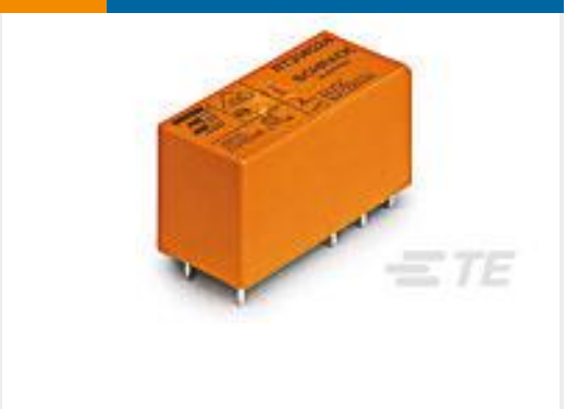
TE Part #1393240-6 RT314615