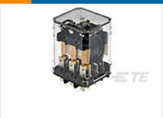
TE Part #7-1393117-8 KUP-14A15-120=KU-