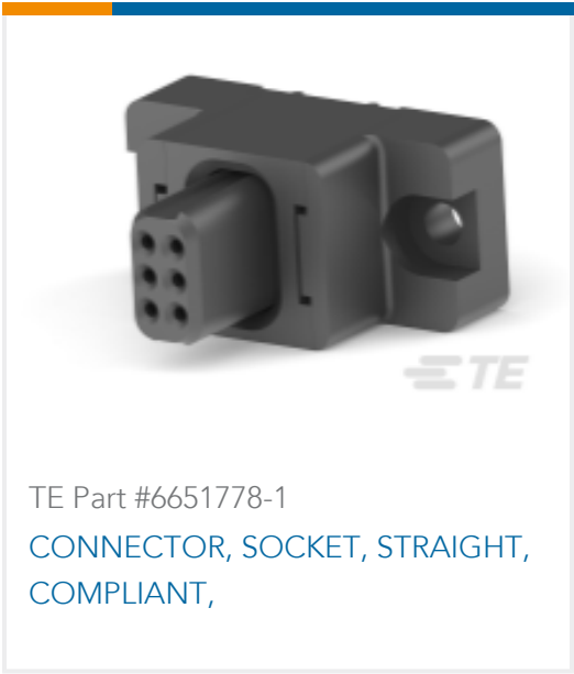
TE Part #6651778-1 CONNECTOR, SOCKET, STRAIGHT, COMPLIANT,