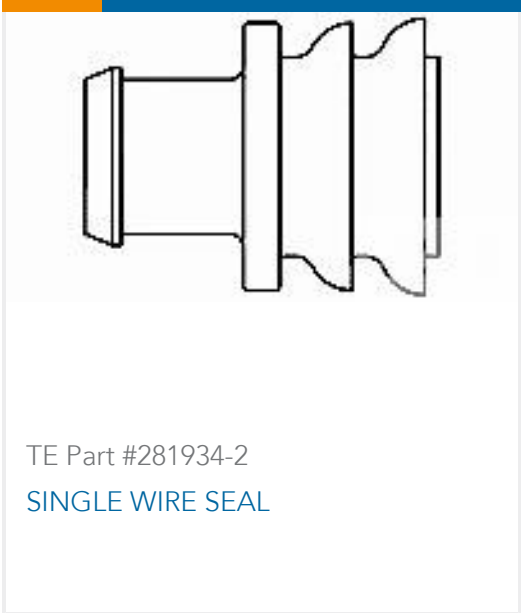
TE Part #281934-2 SINGLE WIRE SEAL