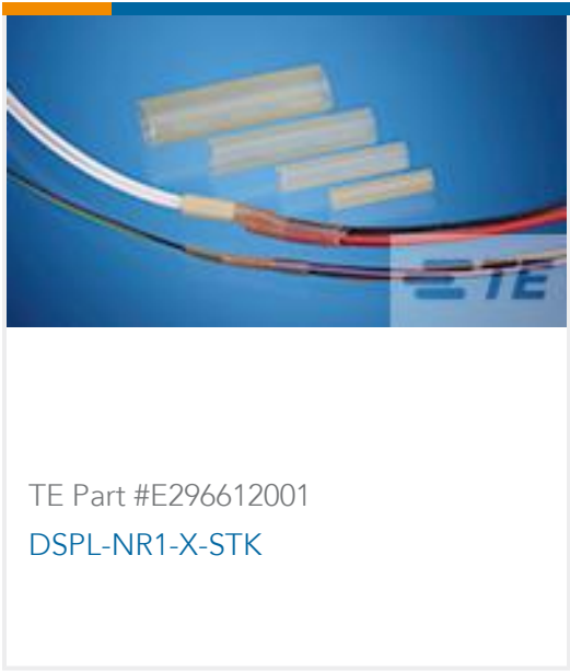
TE Part #E296612001 DSPL-NR1-X-STK