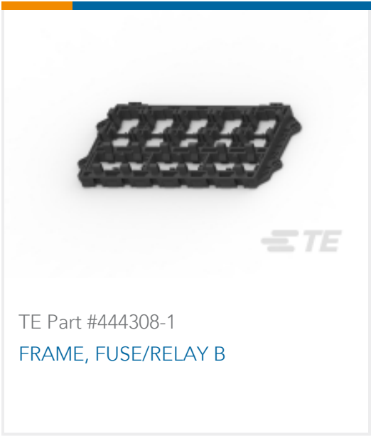
TE Part #444308-1 FRAME, FUSE/RELAY B