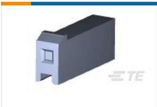
TE Part #640250-1 01P SL156 HSG W/LCK RAMP NATL