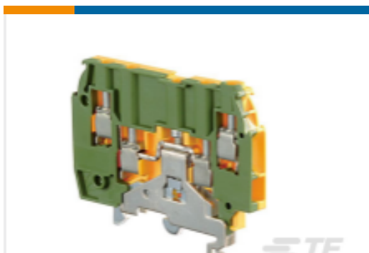
TE Part #1SNA195638R2300 M4/6.4A.P