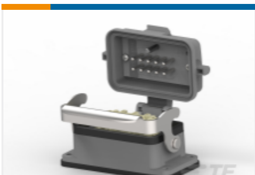
TE Part #T2120100219-000 ZGG-10DSTK,1-7,2-8,3-9,4-6,5-10