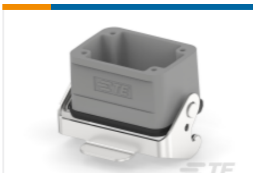
TE Part #T1730060000-000 H6B-TBF-T