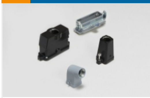
Rectangular Connector Hoods & Bases (1258)