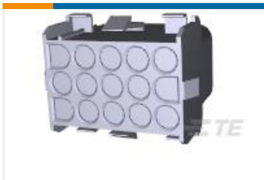
TE Part #1-480711-9 15P UMNL CAP HSG BLK