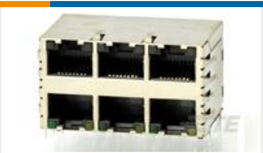
TE Part #5569256-1 STK MJ ASSY,8POS,2X3,SHLD,CAT5