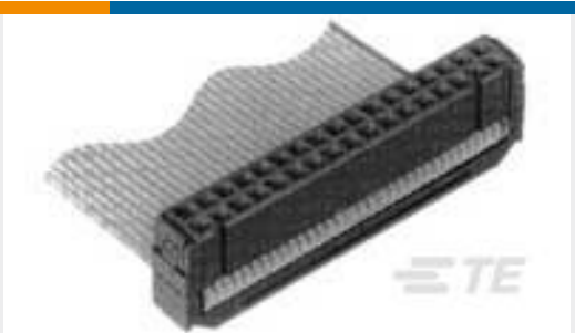
TE Part #1658623-7 30 NOVO MIL 30DP, LEAD FREE