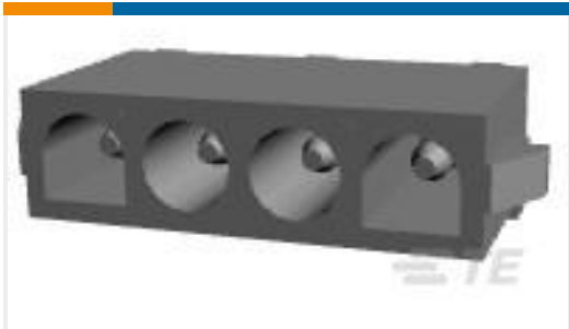
TE Part #350792-1 04P UMML PIN HDR ASSY 94VO