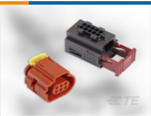
TE Part #929505-5 Timer Connector Housing