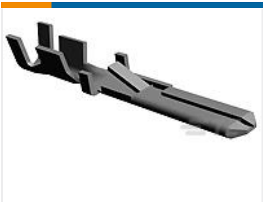
TE Part #928931-2 FF 110 (2.8 X 0.8 MM) TAB PTP CUZN30