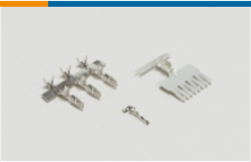
Busbars & Terminals(1)