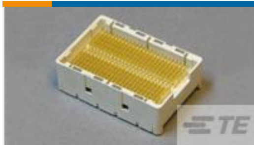
TE Part # 6-1761614-2 STEP-Z PLUG 12MM 200P LF ST