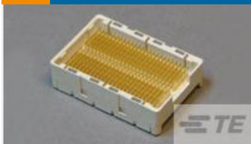
TE Part # 6-2007614-0 STEP-Z PLUG 10MM 200P LF HT