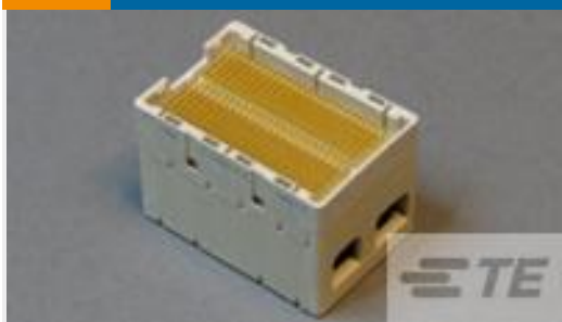
TE Part # 7-1761614-5 STEP-Z PLUG 25MM 200P LF ST