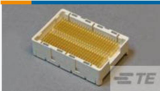
TE Part # 6-1761614-0 STEP-Z PLUG 10MM 200P LF ST