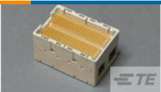
TE Part # 7-1761614-0 STEP-Z PLUG 20MM 200P LF ST