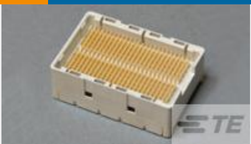
TE Part # 6-1761614-3 STEP-Z PLUG 13MM 200P LF ST