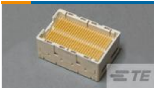
TE Part # 6-1761614-5 STEP-Z PLUG 15MM 200P LF ST