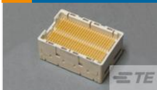
TE Part # 6-2007614-5 STEP-Z PLUG 15MM 200P LF HT