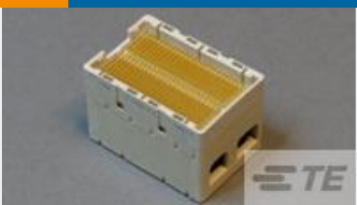
TE Part # 7-2007614-5 STEP-Z PLUG 25MM 200P LF HT