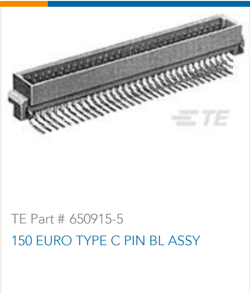
TE Part # 650915-5 150 EURO TYPE C PIN BL ASSY