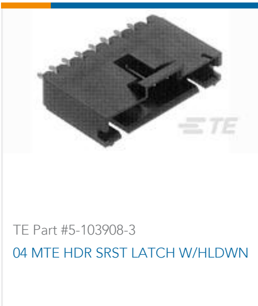
TE Part #5-103908-3 04 MTE HDR SRST LATCH W/HLDWN