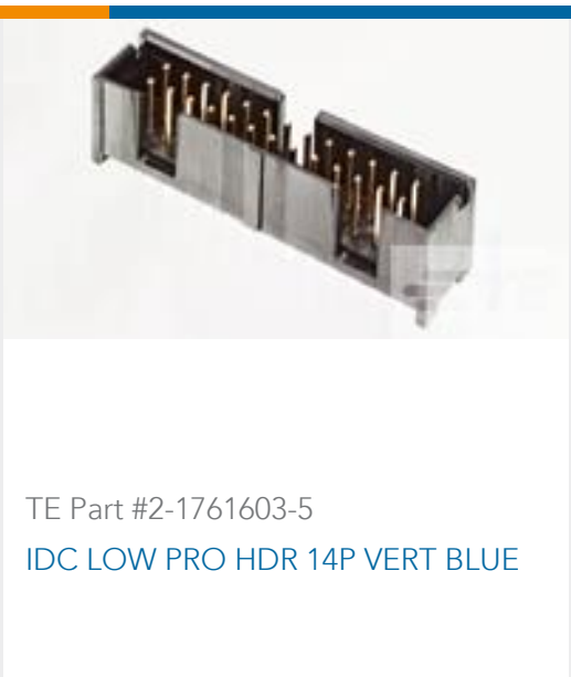
TE Part #2-1761603-5 IDC LOW PRO HDR 14P VERT BLUE