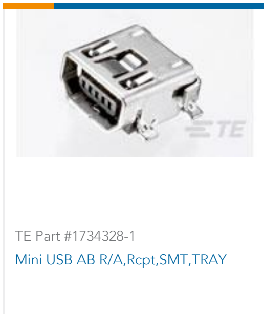
TE Part #1734328-1 Mini USB AB R/A,Rcpt,SMT,TRAY