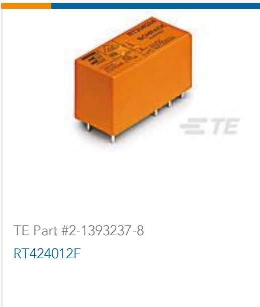
TE Part #2-1393237-8 RT424012F