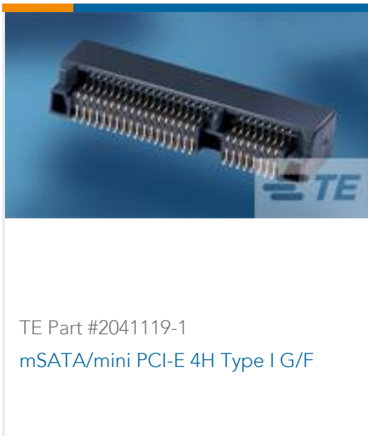
TE Part #2041119-1 mSATA/mini PCI-E 4H Type I G/F

ASSEMBLY,RECEPTACLE,EUROCARD,TYPE C,LEAD