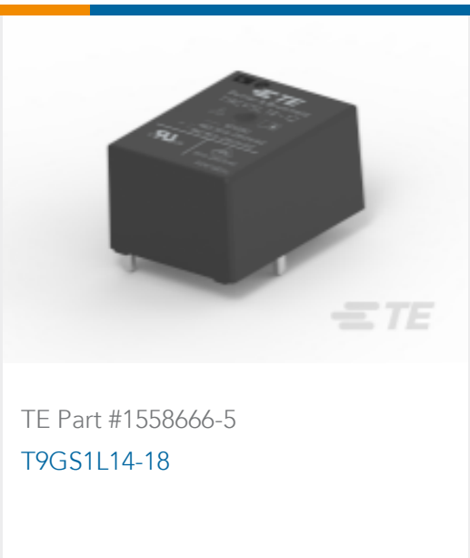
TE Part #1558666-5 T9GS1L14-18