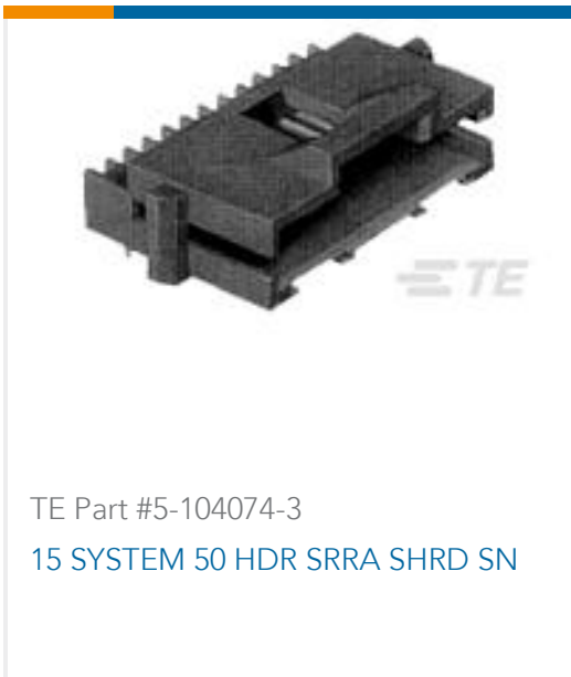
TE Part #5-104074-3 15 SYSTEM 50 HDR SRRA SHRD SN