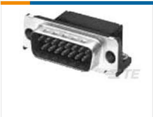
TE Part #5745990-3 09 MSFL PLUG RA 590 (IN,FM)