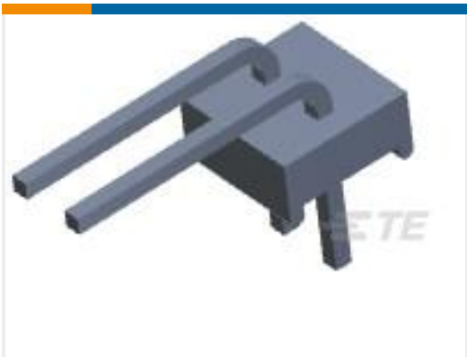
TE Part #640453-2 02P MTA100 HDR ASSY SQ R/A