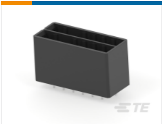
TE Part #1-917337-3 DYNAMIC 3200 HDR ASSY