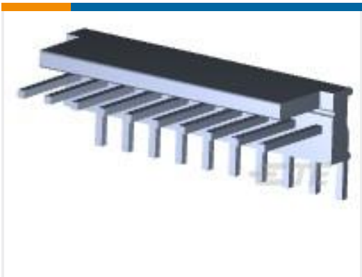
TE Part #1-640455-0 10P MTA100 HDR ASSY SQ R/A POL