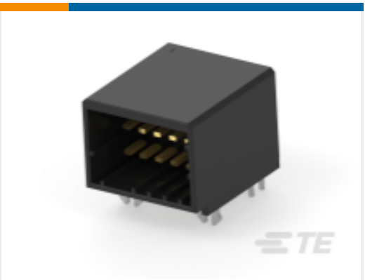
TE Part #1318126-2 DYNAMIC 2000 HDR ASSY