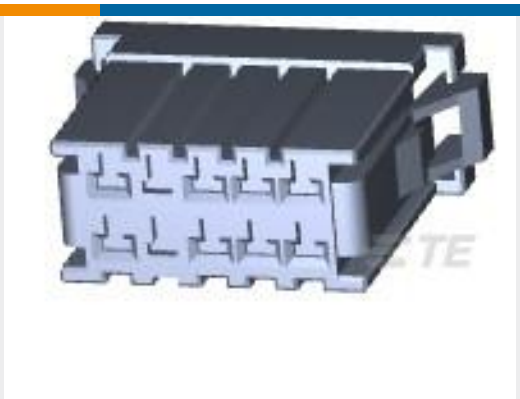
TE Part #178289-5 3.81 DYNAMIC REC HSG 10P D--D