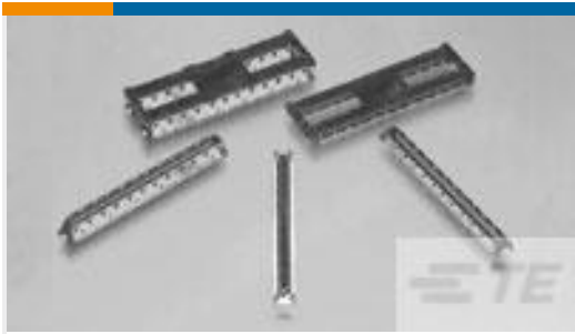
TE Part #3-6318490-6 .5FHR04H,220,S,GIG,08/Sn,HT,NSYes