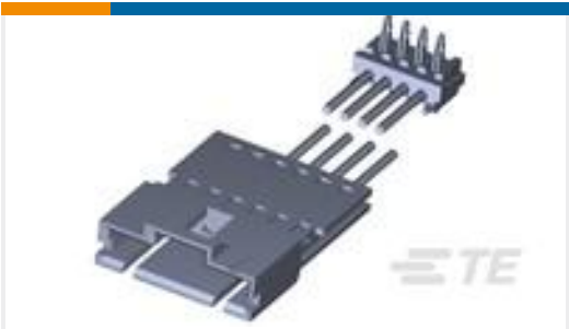
TE Part #1979911-1 6 POSN MODU - 4 POSN CT, 5 IN