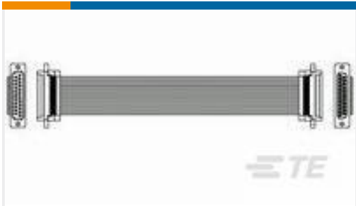
TE Part #1948759-1 AMPLIMITE .050 FLAT ASSY, 10 FT