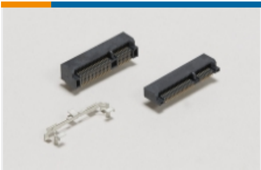
Mini PCI Express & mSATA(1)