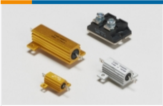
Chassis Mount Resistors(750)