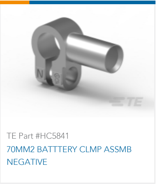
TE Part #HC5841 70MM2 BATTTERY CLMP ASSMB NEGATIVE