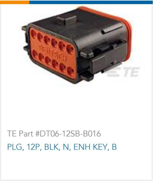
TE Part #DT06-12SB-B016 PLG, 12P, BLK, N, ENH KEY, B