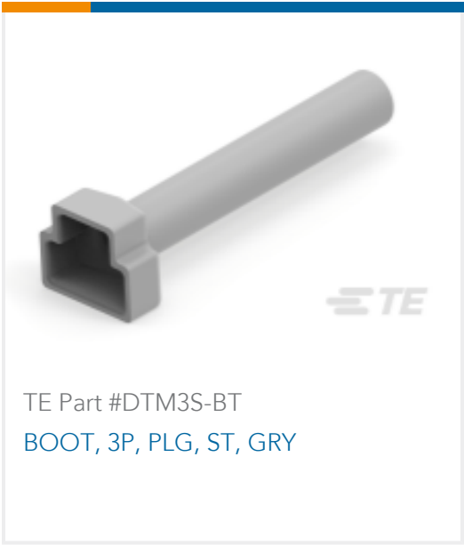
TE Part #DTM3S-BT BOOT, 3P, PLG, ST, GRY