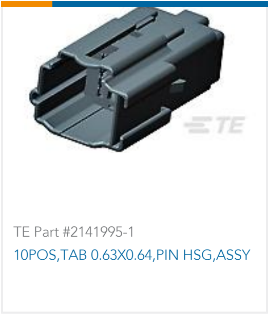
TE Part #2141995-1 10POS,TAB 0.63X0.64,PIN HSG,ASSY