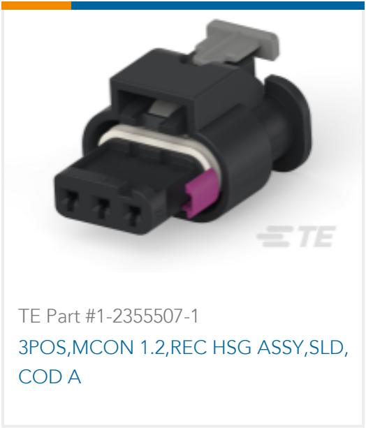
TE Part #1-2355507-1 3POS,MCON 1.2,REC HSG ASSY,SLD, COD A