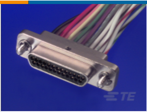
TE Part #1532181-5 M83513/03-C09N, MCKS-N1-B-21P6Q1-18.0