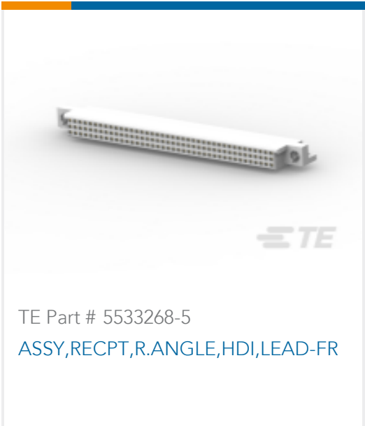
TE Part # 5533268-5 ASSY,RECPT,R.ANGLE,HDI,LEAD-FR