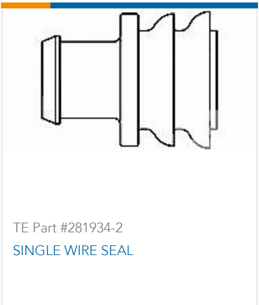
TE Part #281934-2 SINGLE WIRE SEAL