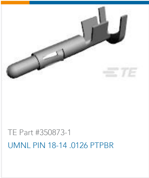
TE Part #350873-1 UMNL PIN 18-14 .0126 PTPBR