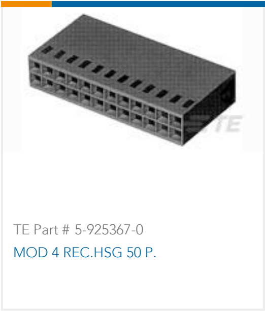
TE Part # 5-925367-0 MOD 4 REC.HSG 50 P.