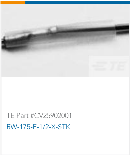
TE Part #CV25902001 RW-175-E-1/2-X-STK