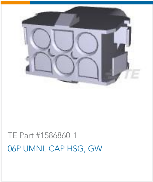
TE Part #1586860-1 06P UMNL CAP HSG, GW