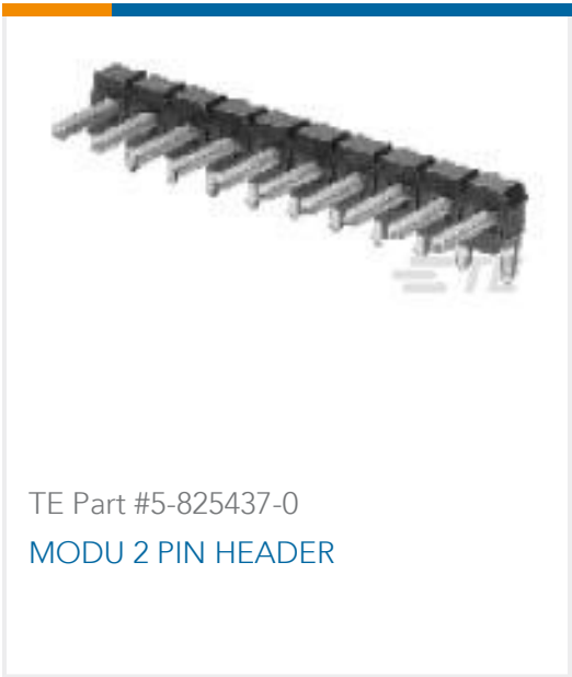
TE Part #5-825437-0 MODU 2 PIN HEADER