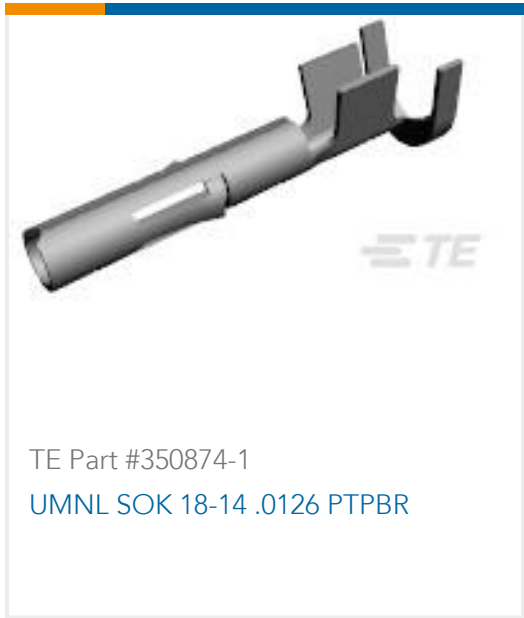
TE Part #350874-1 UMNL SOK 18-14 .0126 PTPBR