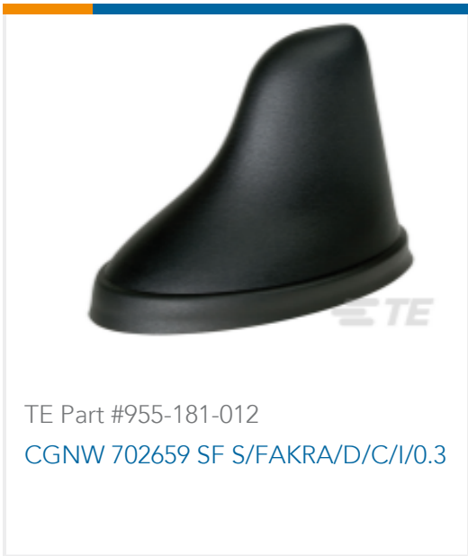
TE Part #955-181-012 CGNW 702659 SF S/FAKRA/D/C/I/0.3