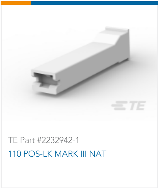
TE Part #2232942-1 110 POS-LK MARK III NAT