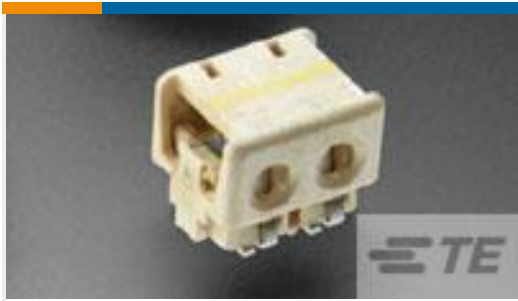
TE Part #2-2106003-3 Connector, SMT-IDC, 3 position, 22AWG