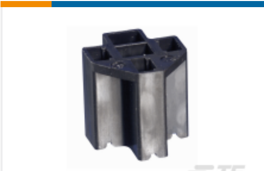
TE Part #1-1904045-1 V23333Z0001A007-EV-100