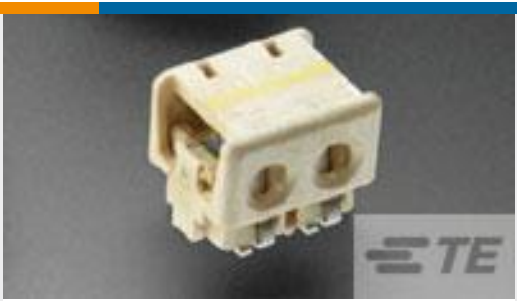
TE Part #1-2106431-2 Connector, SMT-IDC PASS THRU, 2 POS, 20