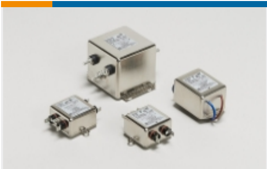
Single Phase Filters(34)