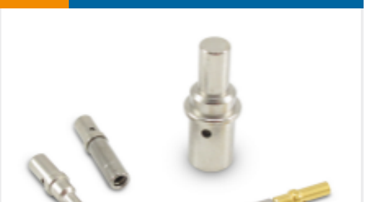
TE Part #0460-202-16141 DEUTSCH Solid Contacts