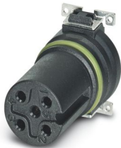
Contact carrier, 4-position, Socket, straight, M12, coding: A, PCB mounting, SMD reflow, Alternative product in accordance with RoHS II without Exemption 6c (Pb < 0.1 %) item no.: 1308041

Please be informed that the data shown in this PDF document is generated from our online catalog. Please find the complete data in the user documentation. Our general terms of use for downloads are valid.