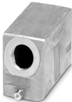
Sleeve housing B16, for single locking latch, material: Die-cast aluminum, salt water resistant, cable outlets: 1, lateral, 1x Pg21, height: 60 mm, cable gland: none, Standard

Please be informed that the data shown in this PDF document is generated from our online catalog. Please find the complete data in the user documentation. Our general terms of use for downloads are valid.