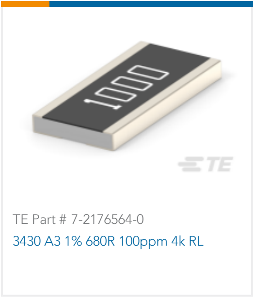
TE Part # 7-2176564-0 3430 A3 1% 680R 100ppm 4k RL