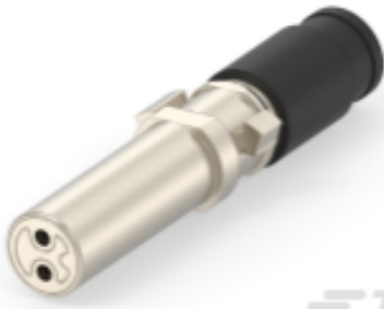
TE Part #40-A711-000-P00 210 DATA ELEMENT CAT 5