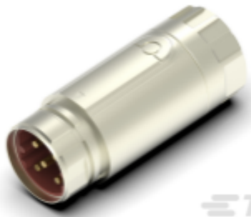
TE Part #HKA503N0045100P000 740 EXTENSION, SPEEDTEC