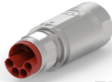
TE Part #HKA407N00420100000 723 HTEC EXTENSION, SPEEDTEC