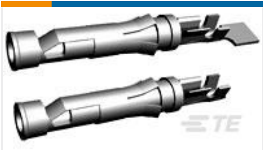
TE Part #66399-4 III+ SKT,24-20,30AU/FL,LP