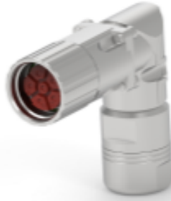
TE Part #BUA107N00420200000 923 PLUG, ANGLED