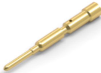
TE Part #61-0004-011-P00 CONTACT PIN 1 MM