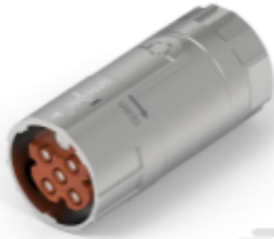
TE Part #HSA501N0045100P000 740 PLUG, SPEEDTEC