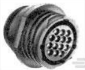
TE Part #206043-5 CPC RECPT ASSEMBLY SIZE 17-14