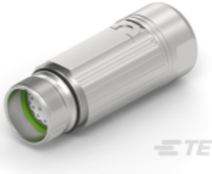
TE Part #AKA034N00590038000 623 EXTENSION, BUS 27