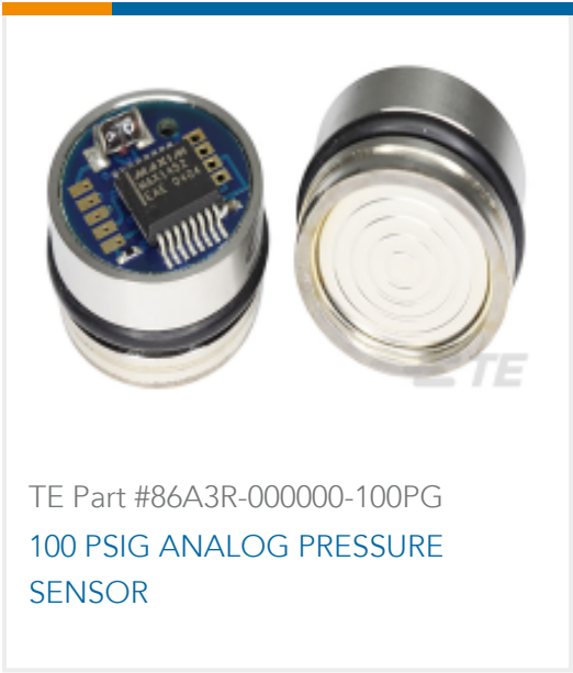
TE Part #86A3R-000000-100PG 100 PSIG ANALOG PRESSURE SENSOR