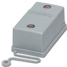
Protective cover, design: VC2, housing material: PA 6, color: gray

Please be informed that the data shown in this PDF document is generated from our online catalog. Please find the complete data in the user documentation. Our general terms of use for downloads are valid.