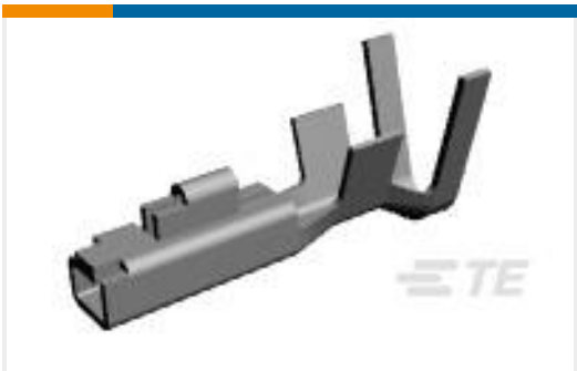
TE Part #175152-2 AMP UNIVE. POWER CONN REC CONT