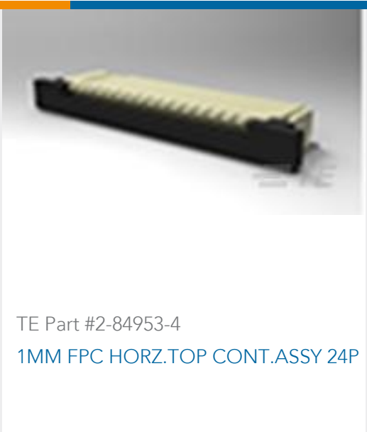
TE Part #2-84953-4 1MM FPC HORZ.TOP CONT.ASSY 24P