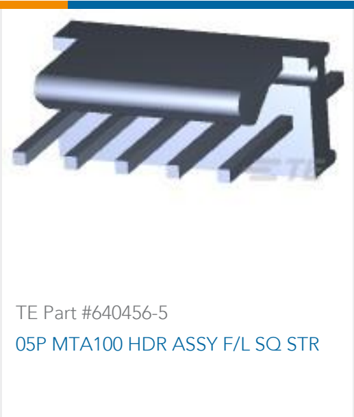
TE Part #640456-5 05P MTA100 HDR ASSY F/L SQ STR