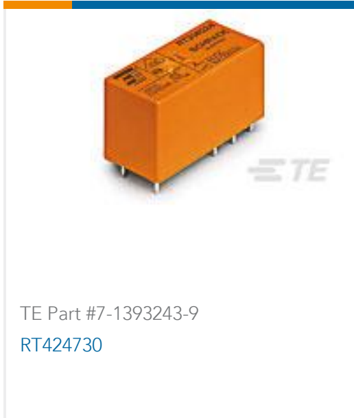
TE Part #7-1393243-9 RT424730