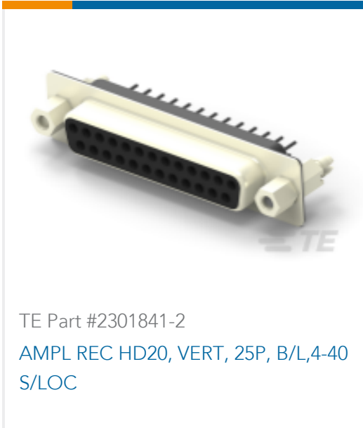
TE Part #2301841-2 AMPL REC HD20, VERT, 25P, B/L,4-40 S/LOC