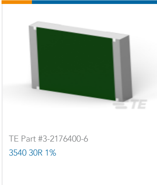
TE Part #3-2176400-6 3540 30R 1%