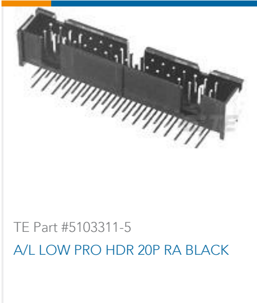
TE Part #5103311-5 A/L LOW PRO HDR 20P RA BLACK