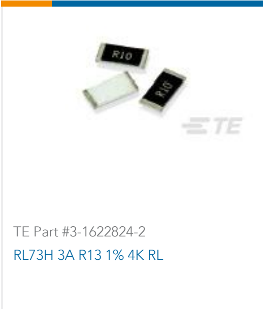
TE Part #3-1622824-2 RL73H 3A R13 1% 4K RL