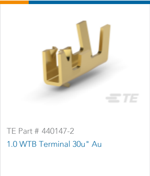
TE Part # 440147-2 1.0 WTB Terminal 30u" Au