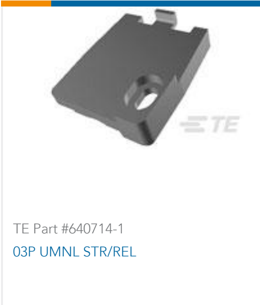
TE Part #640714-1 03P UMNL STR/REL