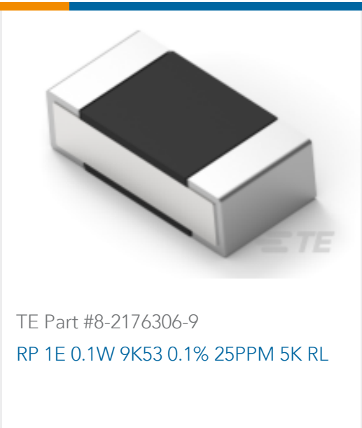
TE Part #8-2176306-9 RP 1E 0.1W 9K53 0.1% 25PPM 5K RL