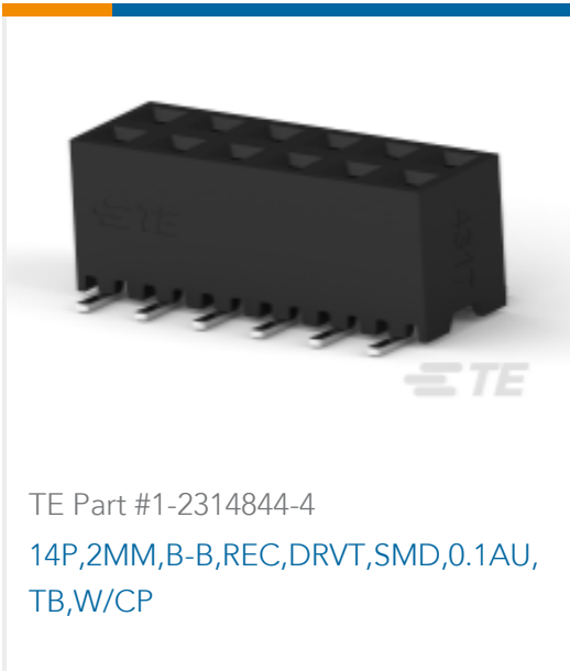
TE Part #1-2314844-4 14P,2MM,B-B,REC,DRVT,SMD,0.1AU, TB,W/CP