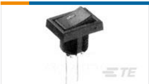
TE Part #5-1437595-2 TRD11F10WL=SUB MINI ROCKER BLA