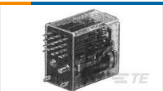
TE Part #1-1393766-9 R10-E1X4-24V=R10