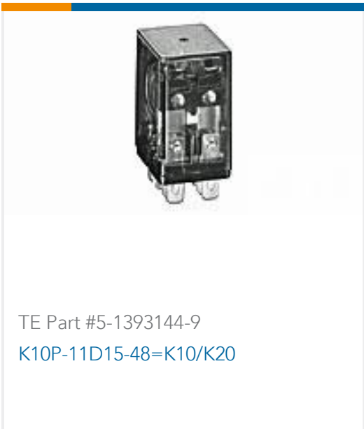
TE Part #5-1393144-9 K10P-11D15-48=K10/K20