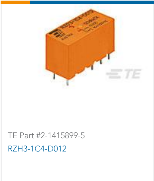
TE Part #2-1415899-5 RZH3-1C4-D012