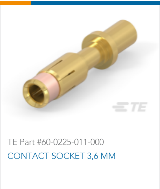
TE Part #60-0225-011-000 CONTACT SOCKET 3,6 MM