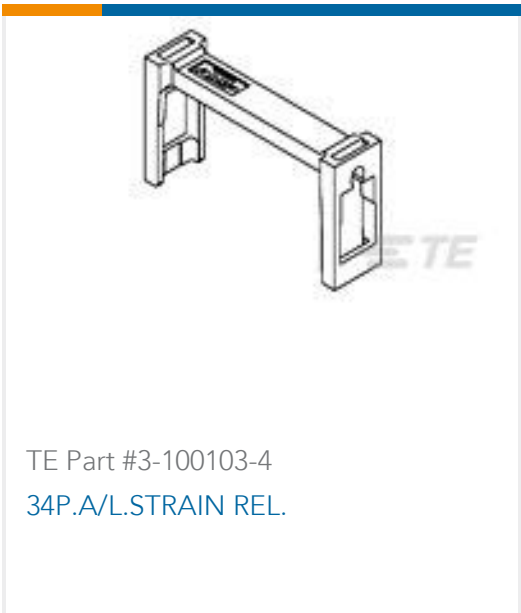
TE Part #3-100103-4 34P.A/L STRAIN REL.