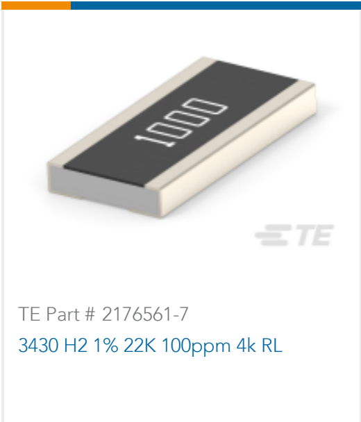
TE Part # 2176561-7 3430 H2 1% 22K 100ppm 4k RL