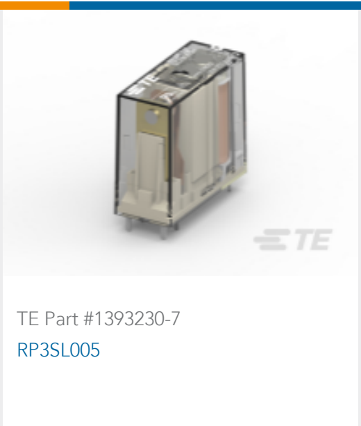
TE Part #1393230-7 RP3SL005