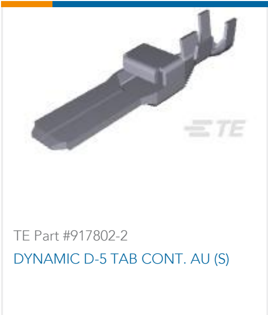
TE Part #917802-2 DYNAMIC D-5 TAB CONT. AU (S)