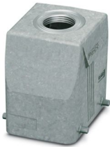
Sleeve housing D50, for double locking latch, material: Die-cast aluminum, salt water resistant, cable outlets: 1, straight, 1x M32, height: 80 mm, cable gland: none, Standard

Please be informed that the data shown in this PDF document is generated from our online catalog. Please find the complete data in the user documentation. Our general terms of use for downloads are valid.