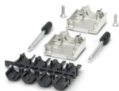
Cable housing for D-SUB-9

Please be informed that the data shown in this PDF document is generated from our online catalog. Please find the complete data in the user documentation. Our general terms of use for downloads are valid.