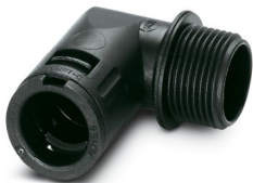
Cable gland, metric thread, IP66 protection, angled

https://www.phoenixcontact.com/us/products/3240926