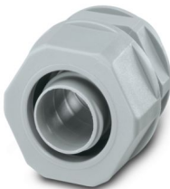
Cable gland made from PP with metric thread, IP65 protection

https://www.phoenixcontact.com/us/products/3240998