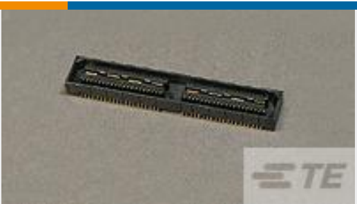
TE Part # 6-1658043-2 MSB0.80RC-ASY080FL,GP,F,-TR