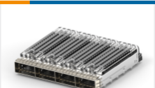
TE Part # 5-2170790-4 CAGE ASSY, 1X4, QSFP28, SPRING, HS, LP