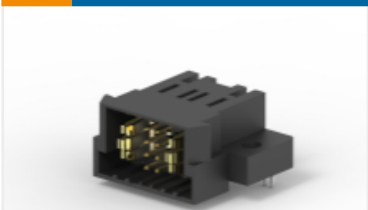
TE Part # 6450834-1 MBXL R/A HDR STR 1P/8S/1P