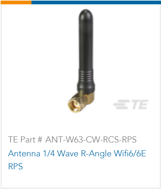
TE Part # ANT-W63-CW-RCS-RPS Antenna 1/4 Wave R-Angle Wifi6/6E RPS