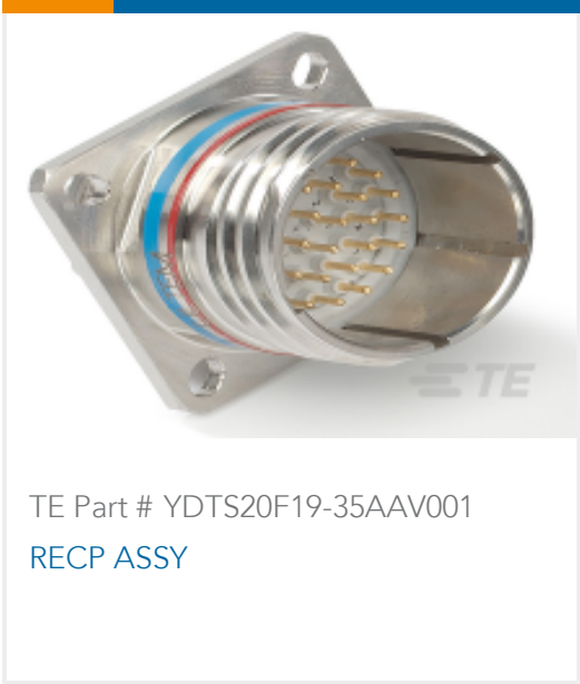
TE Part # YDTS20F19-35AAV001 RECP ASSY