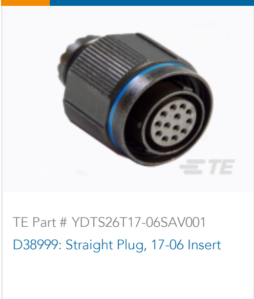
TE Part # YDTS26T17-06SAV001 D38999: Straight Plug, 17-06 Insert