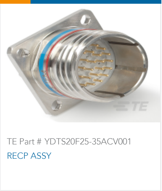
TE Part # YDTS20F25-35ACV001 RECP ASSY