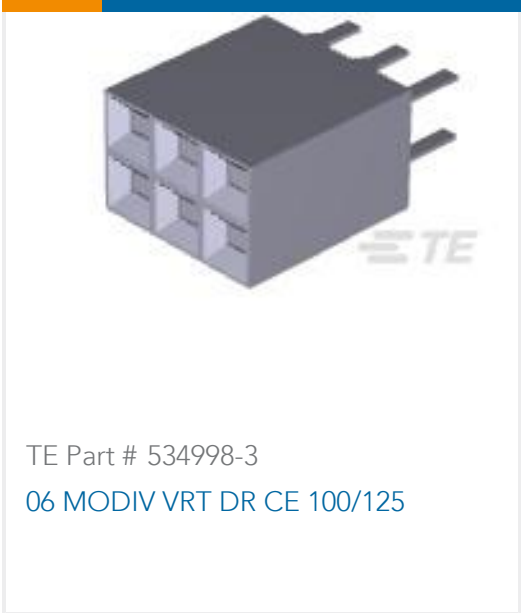
TE Part # 534998-3 06 MODIV VRT DR CE 100/125