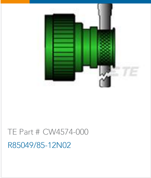
TE Part # CW4574-000 R85049/85-12N02