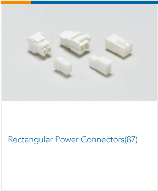
Rectangular Power Connectors(87)