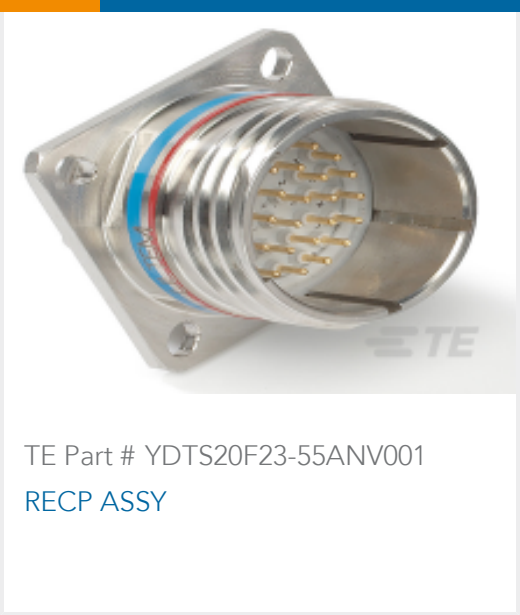
TE Part # YDTS20F23-55ANV001 RECP ASSY