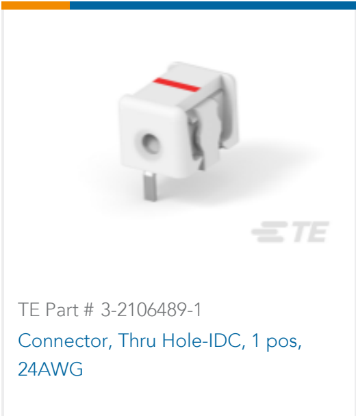
TE Part # 3-2106489-1 Connector, Thru Hole-IDC, 1 pos, 24AWG