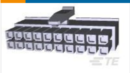
TE Part # 2-794617-0 20POS,MICRO MNL,RCPT HSG