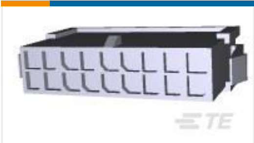
TE Part # 1-794615-8 PANEL MT DBL ROW HSG 18 POS