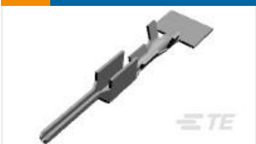
TE Part # 1-794609-1 PIN CONT 26-30 15 GOLD STRIP