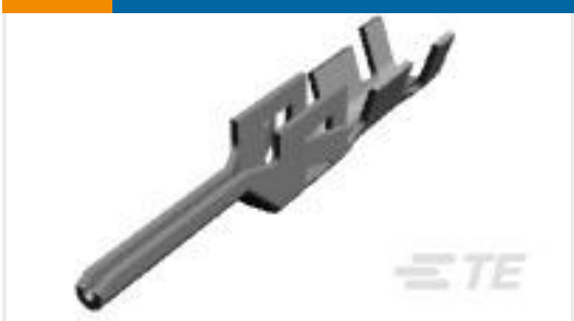
TE Part # 1-794612-1 PIN CONT 20-24 15 GOLD L/P