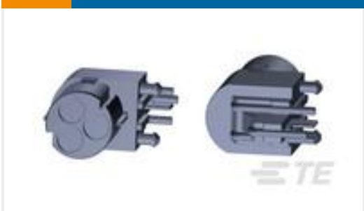
TE Part #293593-1 NECTOR M PIN 0DEG PCB 3P CODE A