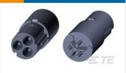
TE Part #293590-1 NECTOR M PIN 90DEG PCB 3P CODE A