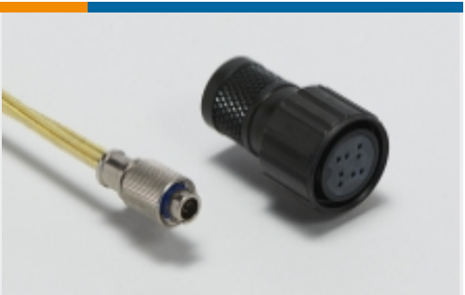
Standard Circular Connectors(124)