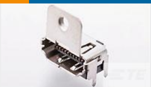
TE Part #1-1747981-4 Std HDMI, RA, SMT, Panel grd, Flange