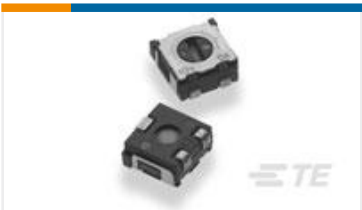
TE Part #1879029-2 3213 1K