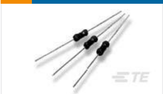
TE Part #1625892-5 3W SM M/OX 5% R47