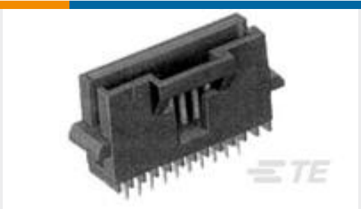
TE Part # 5-104071-7 04 SYSTEM 50 HDR SRST SHRD SN