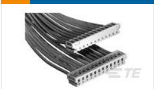
TE Part # 179228-5 CT CRIMP TYPE REC HSG