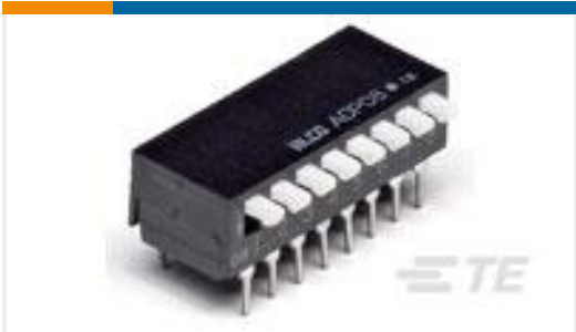
TE Part # 1571999-6 ADP0404=PIANO DIP SWITCH