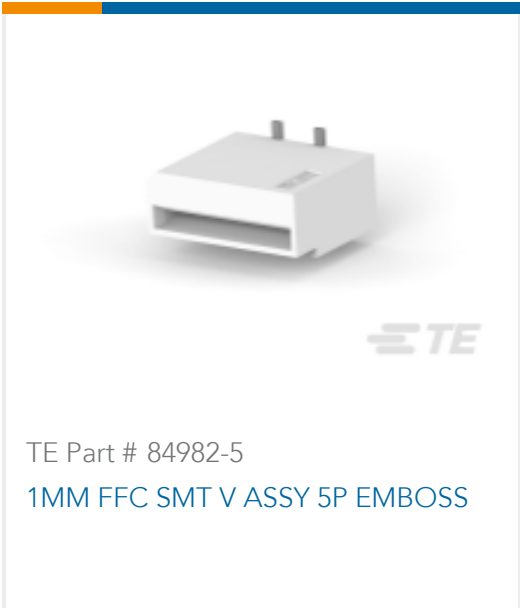
TE Part # 84982-5 1MM FFC SMT V ASSY 5P EMBOSS