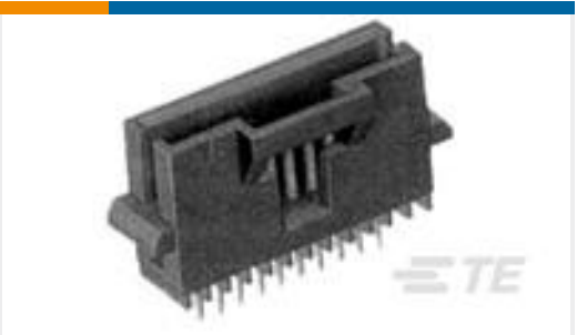
TE Part # 5-104071-8 06 SYSTEM 50 HDR SRST SHRD SN