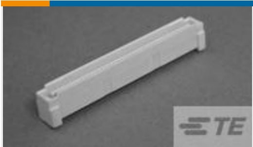
TE Part # 3-5177986-2 0.8FH,P08H.5,060,08/Sn,TR,SC