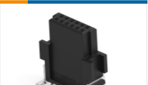
TE Part # 234198-E SMCB 12 F AB VV 7-23 CL * H007 137 E002