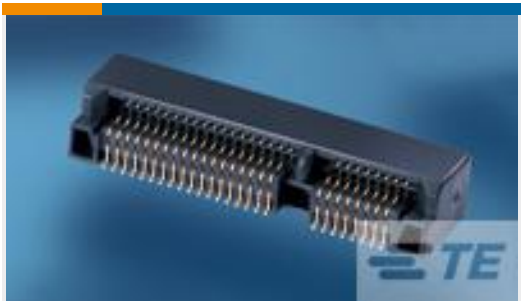
TE Part # 2041119-2 mSATA/mini PCI-E 4H Type I 10u"