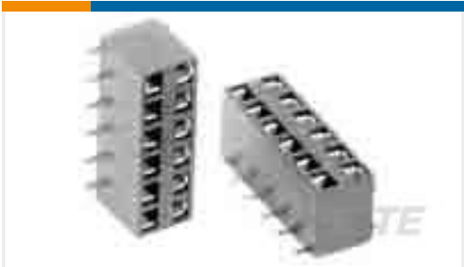
TE Part # 969973-5 2x5P HV100 REC. CON, SMD, GOLD, BLISTER