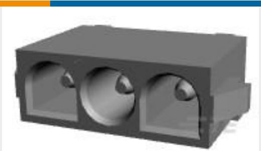
TE Part # 350789-1 03P UMNL PIN HDR ASSY 94VO