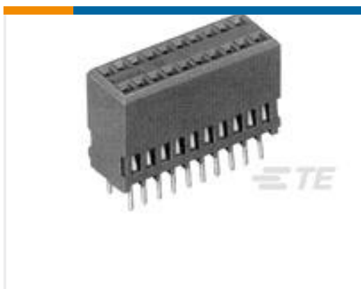
TE Part #104078-3 10 SYSTEM 50 RCPT ASSY DRST