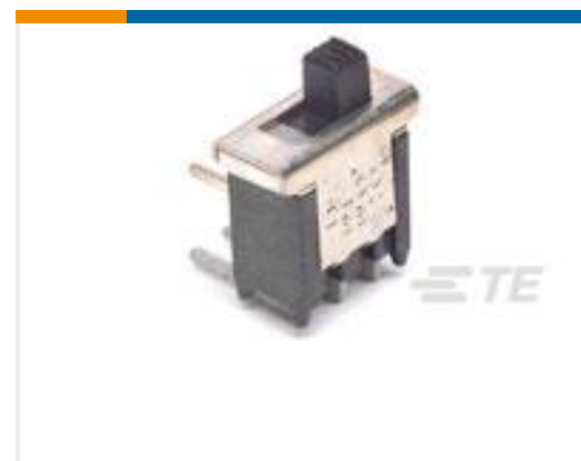
TE Part #1571982-2 TSS11DG1PC04=SLIDE SWITCH SPDT