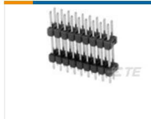
TE Part #146507-2 04 MODII HDR DRST UNSHRD STKG