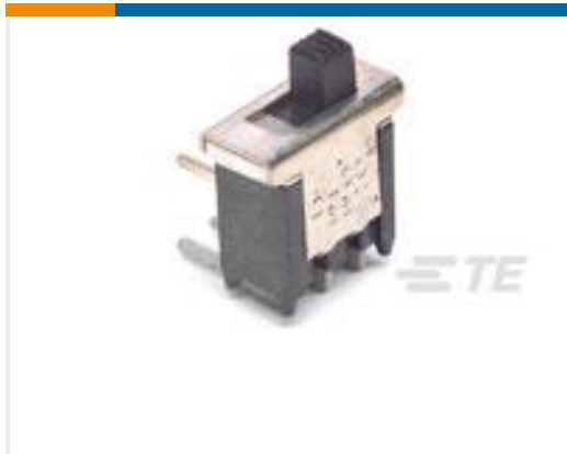
TE Part #1571982-4 TSS11EGPC04=SLIDE SWITCH SPDT