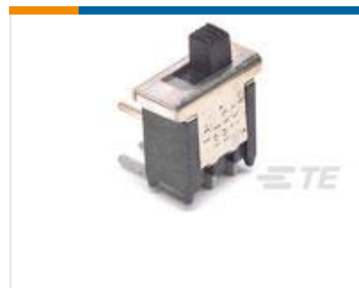
TE Part #1571982-3 TSS11EG1PC04=SLIDE SWITCH SPDT