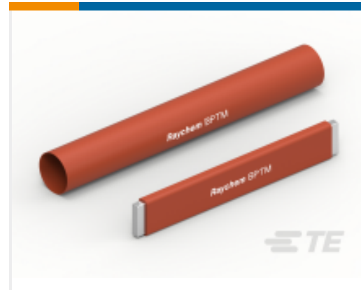
TE Part #478203-000 BPTM-30/12-A/U(B50)