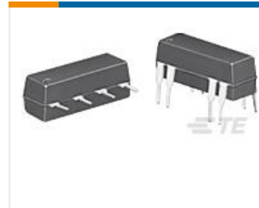
TE Part #3-1393771-4 JWS-117-3=REED RELAYS