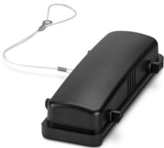
Protective cover B24, for double locking latch, protective cover material: PC, height: 26.3 mm, seal: no

Please be informed that the data shown in this PDF document is generated from our online catalog. Please find the complete data in the user documentation. Our general terms of use for downloads are valid.