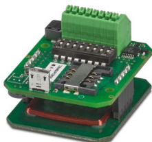
CHARX control modular, RFID device, for connection to CHARX control modular AC charging controllers

Please be informed that the data shown in this PDF document is generated from our online catalog. Please find the complete data in the user documentation. Our general terms of use for downloads are valid.