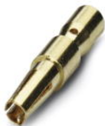
Crimp contact, turned, contact diameter: 1.5 mm, crimp range: 0.5 mm 2 ... 1 mm 2

Please be informed that the data shown in this PDF Document is generated from our Online Catalog. Please find the complete data in the user's documentation. Our General Terms of Use for Downloads are valid ( http://phoenixcontact.com/download )