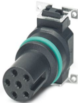
Contact carrier, 6-position, Socket, straight, M8, coding: A, PCB mounting, SMD reflow, Alternative product in accordance with RoHS II without Exemption 6c (Pb < 0.1 %) item no.: 1238988

Please be informed that the data shown in this PDF document is generated from our online catalog. Please find the complete data in the user documentation. Our general terms of use for downloads are valid.