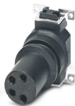
Contact carrier, 4-position, Socket, straight, M8, coding: A, PCB mounting, SMD reflow, Alternative product in accordance with RoHS II without Exemption 6c (Pb < 0.1 %) item no.: 1238984

Please be informed that the data shown in this PDF document is generated from our online catalog. Please find the complete data in the user documentation. Our general terms of use for downloads are valid.