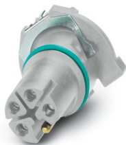
Contact carrier, Power, 5-position, Socket, straight, M12, coding: L, PCB mounting, THR solder connection

Please be informed that the data shown in this PDF document is generated from our online catalog. Please find the complete data in the user documentation. Our general terms of use for downloads are valid.