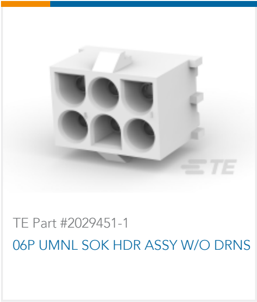
TE Part #2029451-1 06P UMNL SOK HDR ASSY W/O DRNS