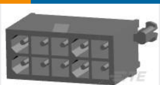
TE Part #1-770858-0 10P MINI UMNL HDR ASSY SNDBL L