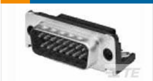
TE Part #5788793-2 09 HTMSFL PLUG RA 318 (SL,BL)