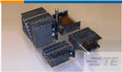
TE Part # 2057405-1 IMP100S,R,RA2P10C,UG,39

This information is provided based on reasonable inquiry of our suppliers and represents our current actual knowledge based on the information they provided. This information is subject to change. The part numbers that TE has identified as EU RoHS compliant have a maximum concentration of 0.1% by weight in homogenous materials for lead, hexavalent chromium, mercury, PBB, PBDE, DBP, BBP, DEHP, DIBP, and 0.01% for cadmium, or qualify for an exemption to these limits as defined in the Annexes of Directive 2011/65/EU (RoHS2). Finished electrical and electronic equipment products will be CE marked as required by Directive 2011/65/EU. Components may not be CE marked. Additionally, the part numbers that TE has identified as EU ELV compliant have a maximum concentration of 0.1% by weight in homogenous materials for lead, hexavalent chromium, and mercury, and 0.01% for cadmium, or qualify for an exemption to these limits as defined in the Annexes of Directive 2000/53/EC (ELV). Regarding the REACH Regulation, the information TE provides on SVHC in articles for this part number is based on the latest European Chemicals Agency (ECHA) 'Guidance on requirements for substances in articles' posted at this URL: https://echa.europa.eu/guidance-documents/guidance-on-reach